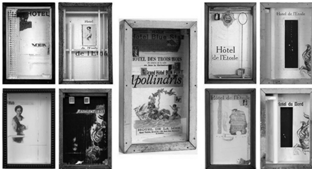
Figure 2. Some examples of Joseph Cornell's "Hotel" series of shadow boxes 4

In or around the year 2000, Robert Coover (American postmodern writer and professor of literature at Brown University) was contacted by Jonathan Safran Foer (then an undergraduate student at Princeton University). Foer's formal proposal to Coover (which also contained a set of images) was meant to solicit Coover's participation in a writing project concerning the works of Joseph Cornell. Coover's task was to write something devoted to the series of boxes often referred to as Cornell's "Grand Hotels" (see Figure 2). And along with an impressive list of other American literary heavyweights, including Joyce Carol Oates, Barry Lopez, Robert Pinsky, and Lydia Davis, Coover took up the challenge and provided Foer's collection, A Convergence of Birds (2001), with five short vignettes. These vignettes were later added to and expanded into the ten chapters of Coover's own collection, The Grand Hotels (of Joseph Cornell) (2002) 3 .