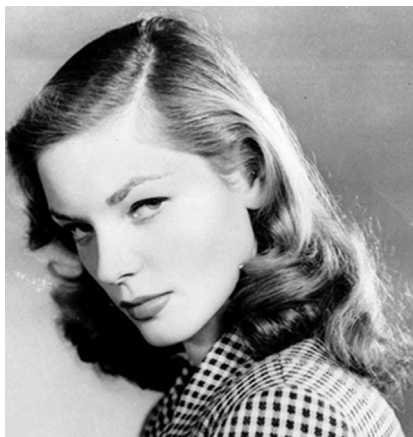
Figure 5. Lauren Bacall, still image from the film, To Have and Have Not 15

happened”); this is the diegetic function of Coover’s text. The occasion and the purpose of Coover’s text is to verbally interpret and explain the experience of confronting the narrative of Cornell’s box. This is where Coover’s description of Cornell’s box collides with the diegetic dimension of his story’s narration. In other words, Coover’s narrator is telling the reader that Cornell’s box has a definite set of qualities that can be discerned through a sequential decoding of the characters, environments, and events involved in the mechanisms of a collage devoted to Cornell’s own coded interpretation of the character, Lauren Bacall, within the context of Bacall’s role in the film, To Have and Have Not (see Figure 5).