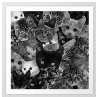
Figure 3. Spooky Dooky, BW Cat Collage 6

The following example of non-narrative collage, composed by the collage artist Spooky Dooky, juxtaposes numerous images of cat heads within a single panel (see Figure 3). The only proposition that might be derived from the interpretation of this collage is, “(Here are some) cat heads.” And while it might be safe to propose that the collage involves a set of characters and, at a stretch, that a certain potential exists for a story-world to emerge, there is nothing within the intra-textual graphic syntax of the collage to suggest an event (or a series of events) that might connect these cat heads to a narrative that has any story potential beyond the descriptive statement of, again, “(Here are some) cat heads”.