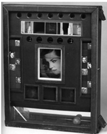
Figure 4. Joseph Cornell, Untitled (Penny Arcade Portrait of Lauren Bacall) 12

Involving two central characters 1. the figure of Lauren Bacall as the focal point of the box's construction and 2. the iconic wooden ball that travels through the interior of the box Cornell's Penny Arcade Portrait not only involves the viewer/player with a series of recorded moments related to these characters, the images of Bacall as a child, along with the photo clippings of Bacall's cocker spaniel, Droopy (both set within the mosaic columns on the right and the left), add to the cast of characters referenced by the overall design of the collage. Furthermore, the elements of time and place specified by Bal are played out quite literally as the wooden ball slowly navigates the interior of the box (through a purpose-built slot at the top of the right side of the box), the film noir diorama of Manhattan skyscrapers is sequentially connected to the various images of Bacall and her dog, and the active component of the parodic "penny arcade game" mechanism is set in motion. The vector-specific, revolving animation of the rolling ball also conveys a suggestion of film stock being reeled through a projector, a quality which is further enhanced by the delicate "sound track" of the ball's musical "plink plink plink" negotiation of the inclined glass platforms that form the concealed architecture of the box time and place set into the immediate cinematographic context of sound and image 11 .